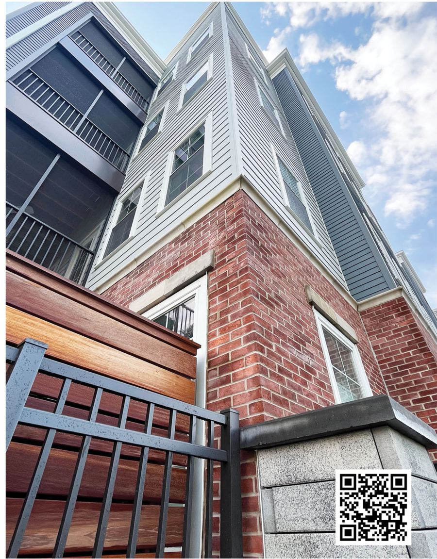
Schoolhouse Red Metropolitan Thin Brick

Our installation craftsmen are experts of the trade. Installations follow all specifications set by the National Concrete Masonry Association, backed by our 1 Year Installation and 50 Year Product Limited Warranties.