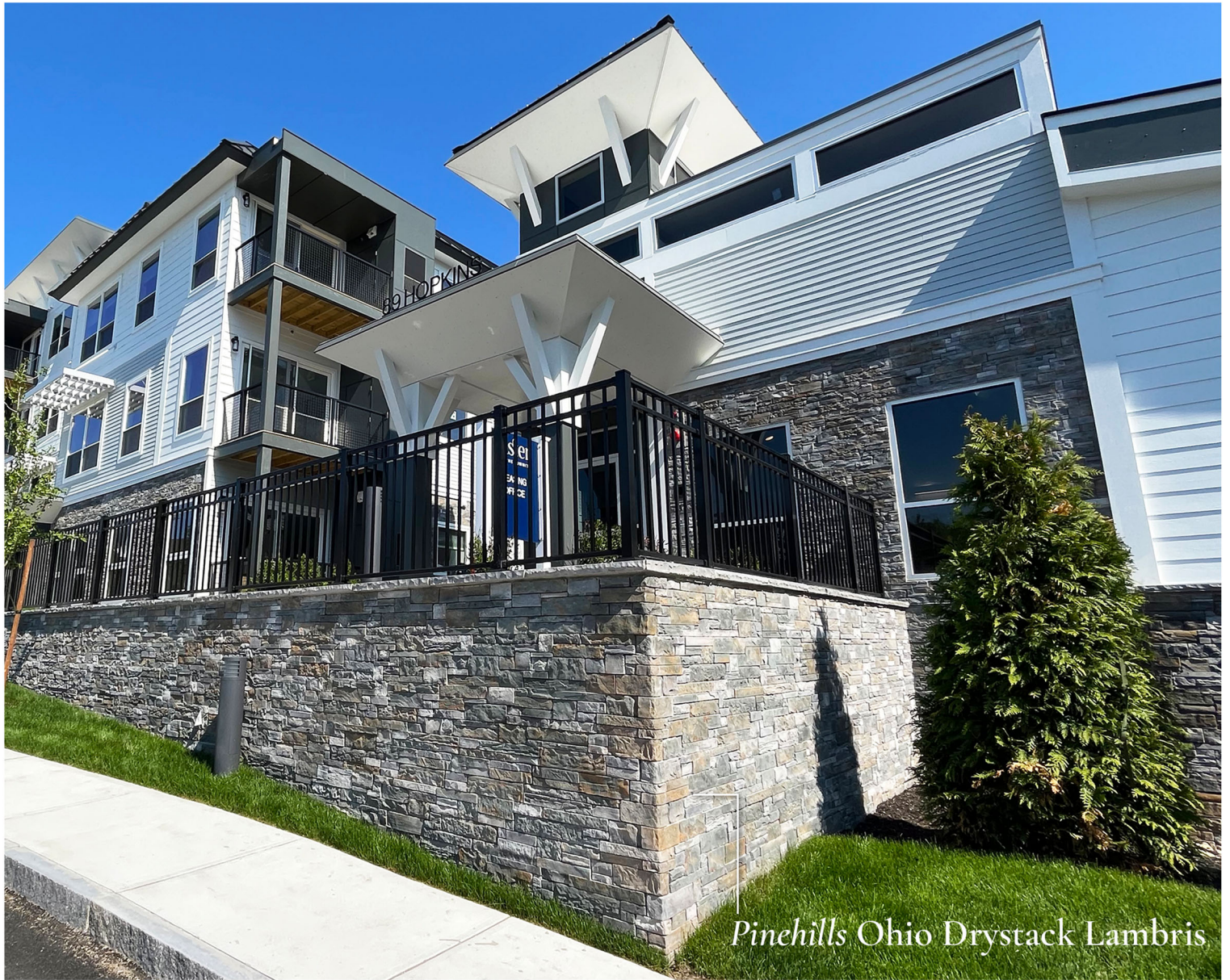
Pinehills Ohio Drystack Lambris

Multifamily, Assisted Living, Churches, Luxury Apartments